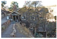
Top-right: The photographic studio at Kolb Studio.